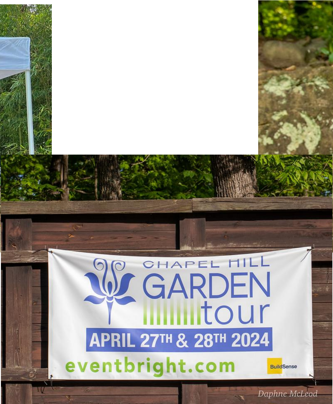
Signs and Banners