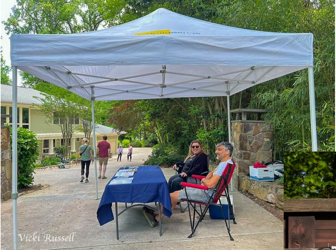
Fundraising and Ad Sales